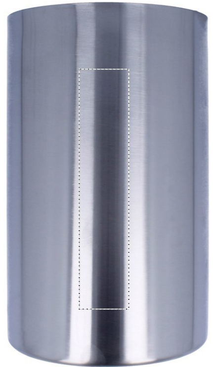
3. FRONT HIGH