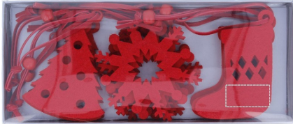
1. FELT SOCK